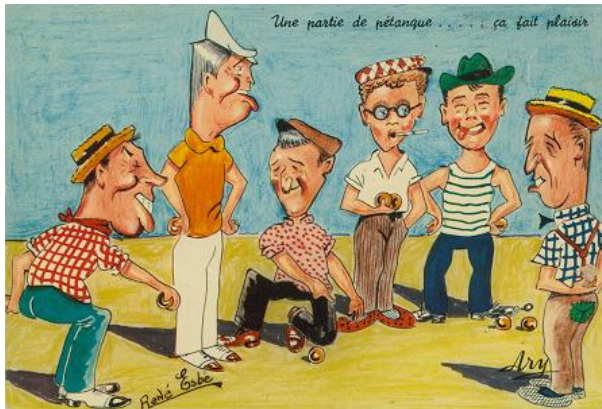
A game of Petanque.....it's a pleasure (....and don't we know it)